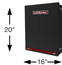
LA500CONTXLMDC XLSOLARCONTDC Extra Large Control Box

* Basic set up with remotes programmed. Does not include added accessory power draw. LiftMaster low power draw accessories recommended to extend cycles and standby time on battery backup.