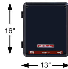
LA500CONTDC Standard Control Box